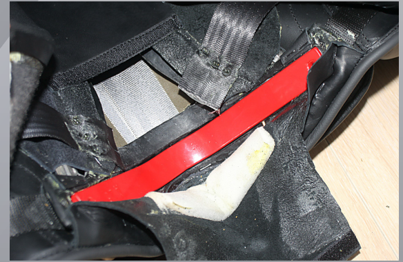
6. Insert new gullet iron, and insert bushings into corresponding holes