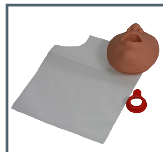
Ambu hygienic system