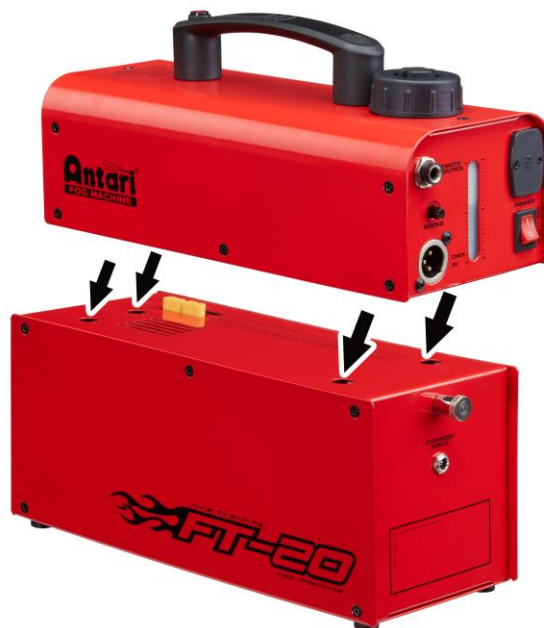
Align and insert head unit to base

Step 5: To start making fog, locate the rotary knob on the back for output level adjustment, and press the button to start making fog, release to stop.