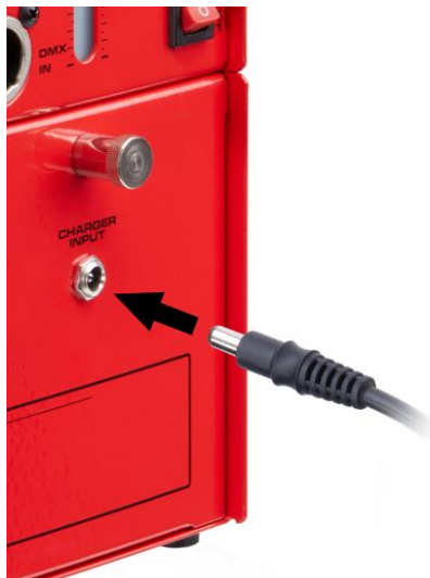
Plug in charger

Step 3: Charge the battery by plug the charger adaptor into a grounded electrical outlet. Yellow light on the adaptor indicates charging, when it turn green indicate charge complete. Please note the battery require 15 hours charge time.