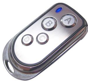
W-2 Wireless Transmitter

Wireless remote control system WTR-20 consists of a transmitter equipped with four buttons to activate, deactivate, increase and decrease fog output and an onboard receiver attached to the rear panel of FT-20 fog machine.