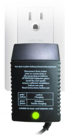
Green indicates charging complete