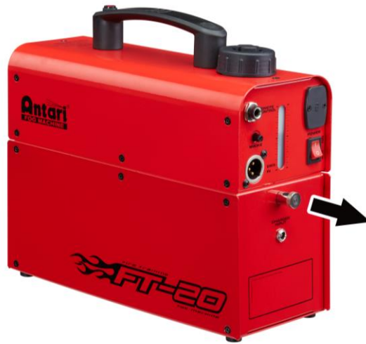
Pull to release locking lever

Step 4: Connect the battery base or power base to the machine. Turn on the machine to start operation.