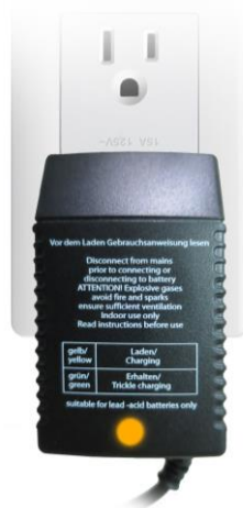
Yellow indicates charging