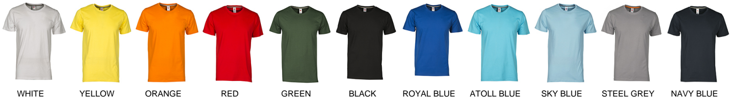
WHITE YELLOW ORANGE RED GREEN BLACK ROYAL BLUE ATOLL BLUE SKY BLUE STEEL GREY NAVY BLUE