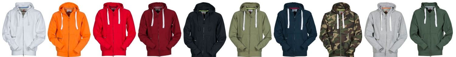
WHITE ORANGE RED BORDEAUX BLACK ARMY GREEN NAVY BLUE CAMOUFLAGE MELANGE GREY GREEN